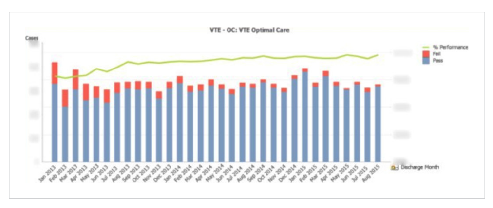
Figure 1. VTE optimal bundle compliance

Stephen Mandt, PharmD Pharmacy Allina Health