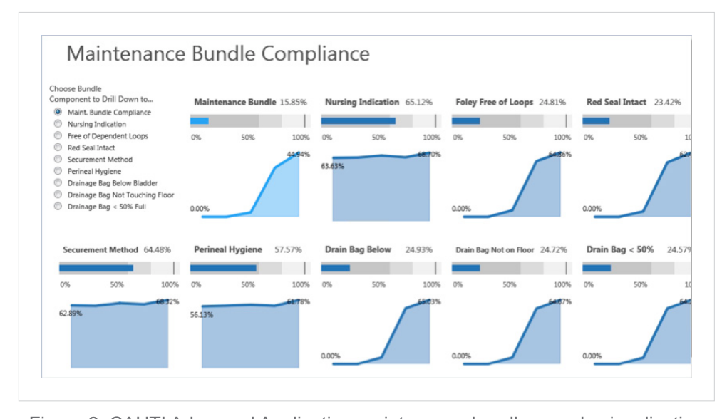
Figure 2. CAUTI Advanced Application maintenance bundle sample visualization

The increased visibility of maintenance bundle components (see Figure 2) made it clear that indwelling urinary catheter care was inconsistent across hospital units. Nursing procedures for catheter care varied between units, with some demonstrating effective catheter care and a low number of CAUTIs while others did not.