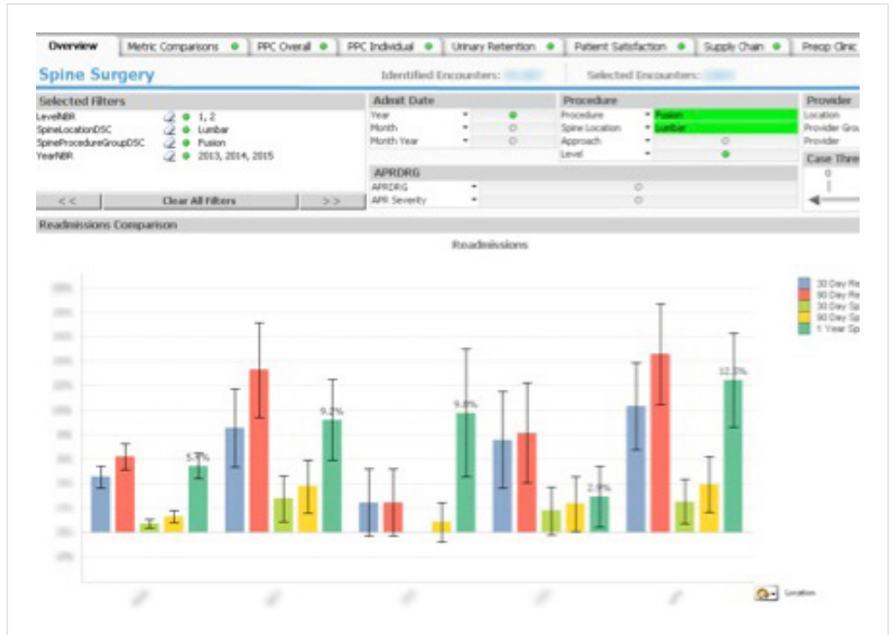
Figure 2. Sample executive dashboard—readmissions view