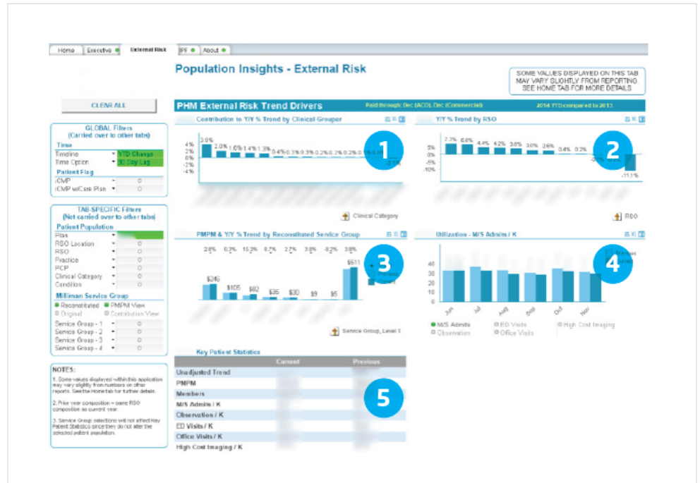
Figure 2. Sample external risk dashboard

Similar to the external risk dashboard, an internal performance framework dashboard displays a high-level comparison of this initiative’s plan rollups in terms of PMPM trends for the current year (relative to the prior year) and for the prior year (relative to two years prior).