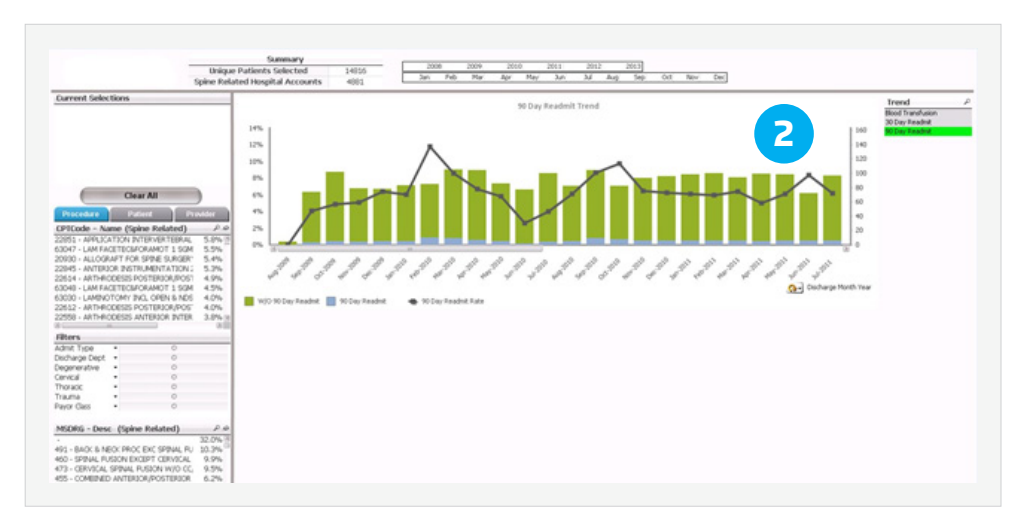
Figure 2: Readmissions