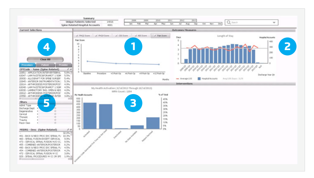
Figure 1: Dashboard