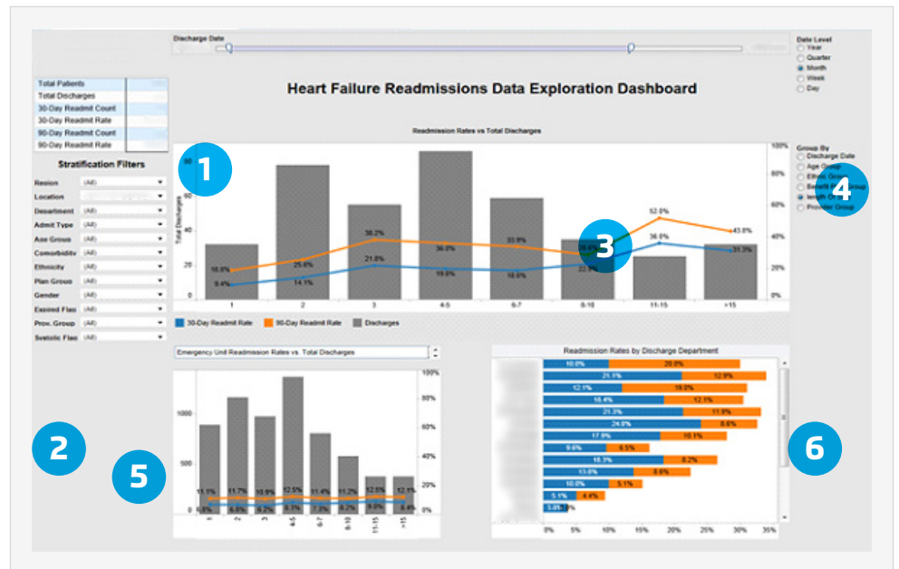
Figure 1: HF readmissions data exploration dashboard