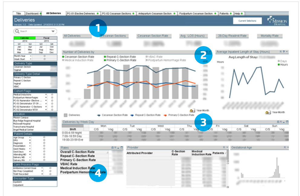
Figure 2: Sample C-section all deliveries dashboard