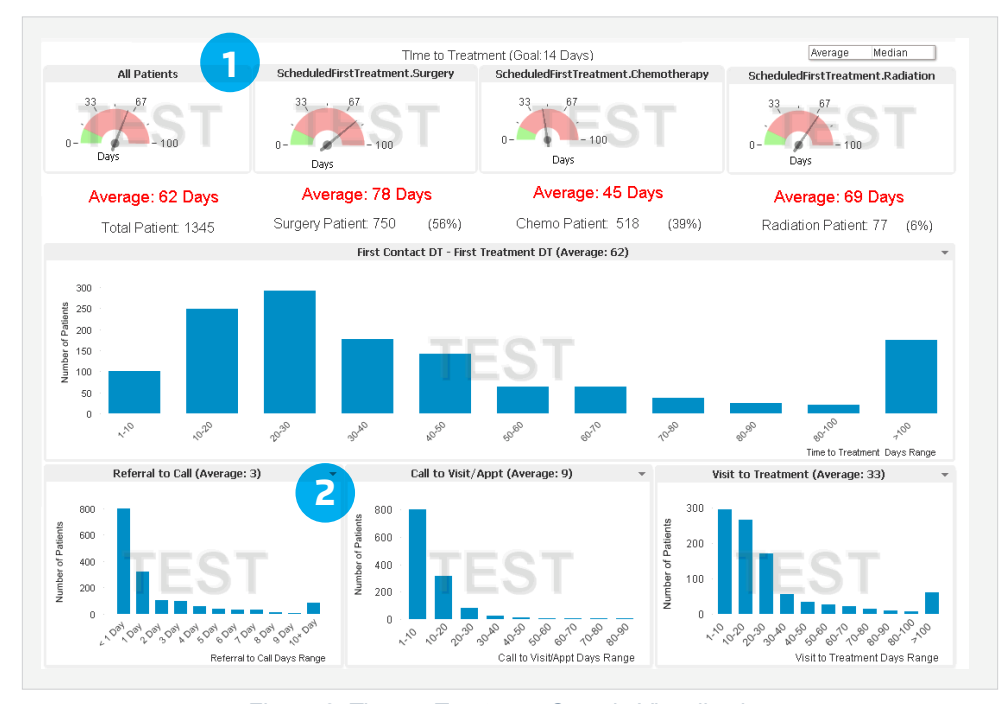
Figure 2: Time to Treatment Sample Visualization