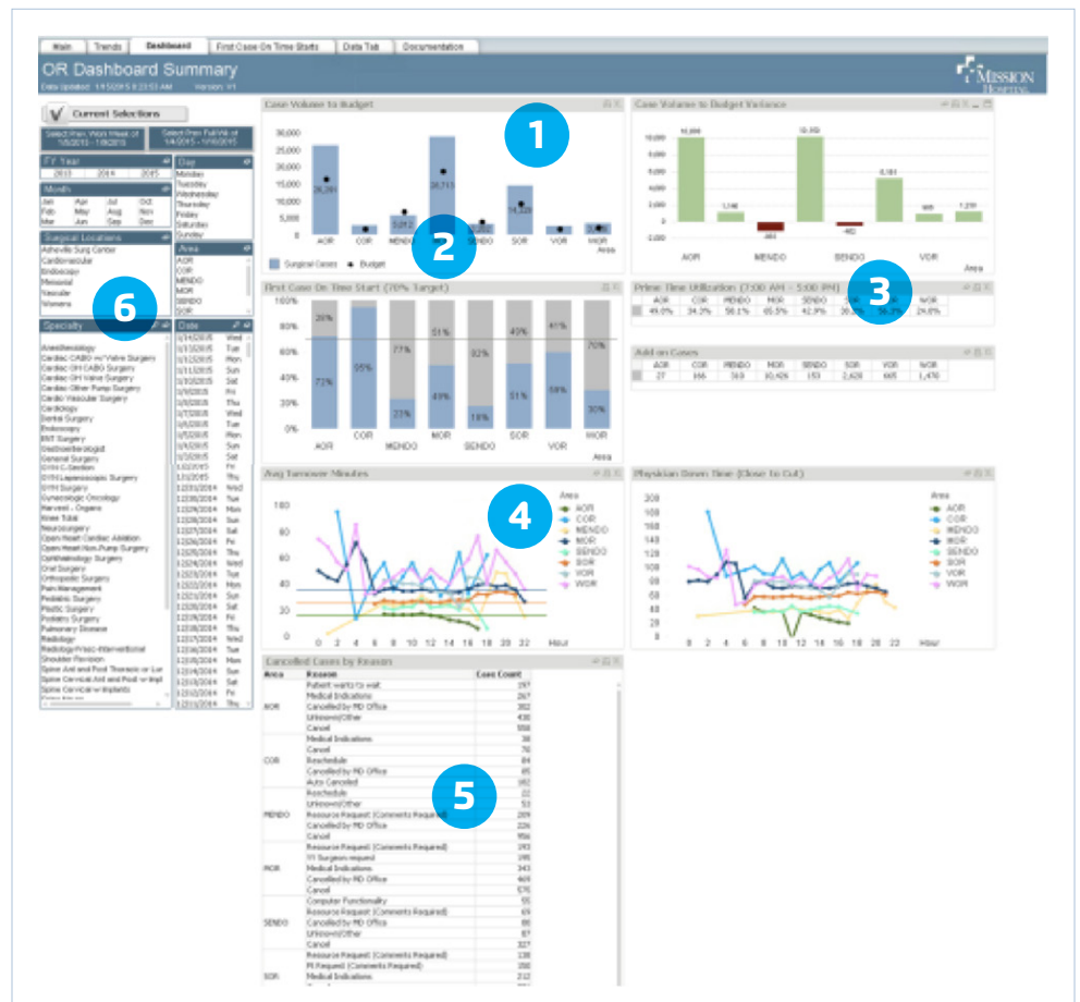
Figure 1. Sample OR Dashboard summary visualization